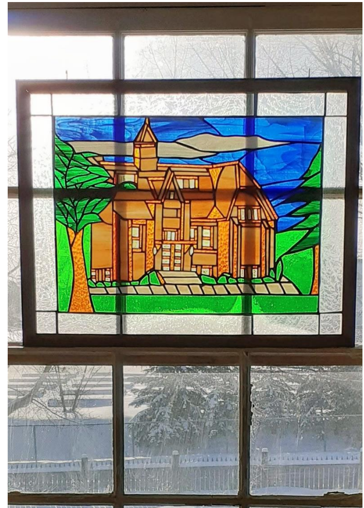
Multicultural Heritage Centre

The Detailed Action Plan is intended to be a living document with operational considerations and tasks suggested to advance the stated goals within a 3 to 5-year period. In many cases these Operational Considerations and Tasks align with key Town planning goals and augment current activities undertaken by Cultural and Tourism Development. There may be additional operational considerations and tasks that are undertaken in the next 3 to 5-years that support these goals based on arising opportunities including opportunities in planning, partnership, funding or other.