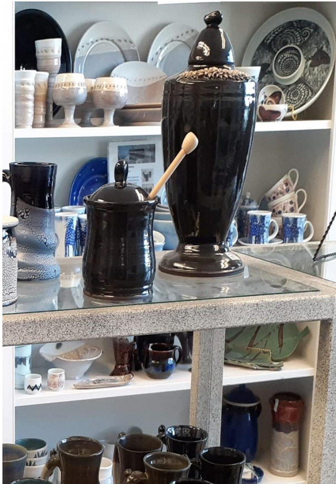
Parkland Potters' Guild

Actions outlined within this plan rely on existing and new resources to be advanced. Outlined below are an encapsulation of resources required and suggestions for re-allocation of existing resources where possible to best respond to the findings and actions within this plan.