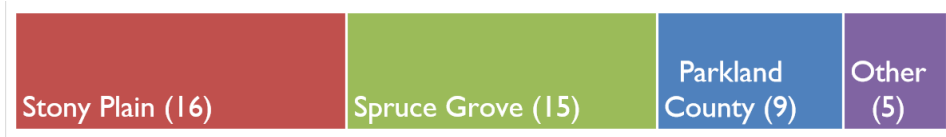
Elder Abuse Cases by Location